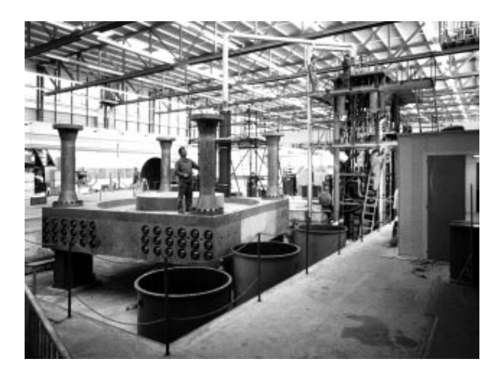
Fig. 1.2: .Setting up the magnet.