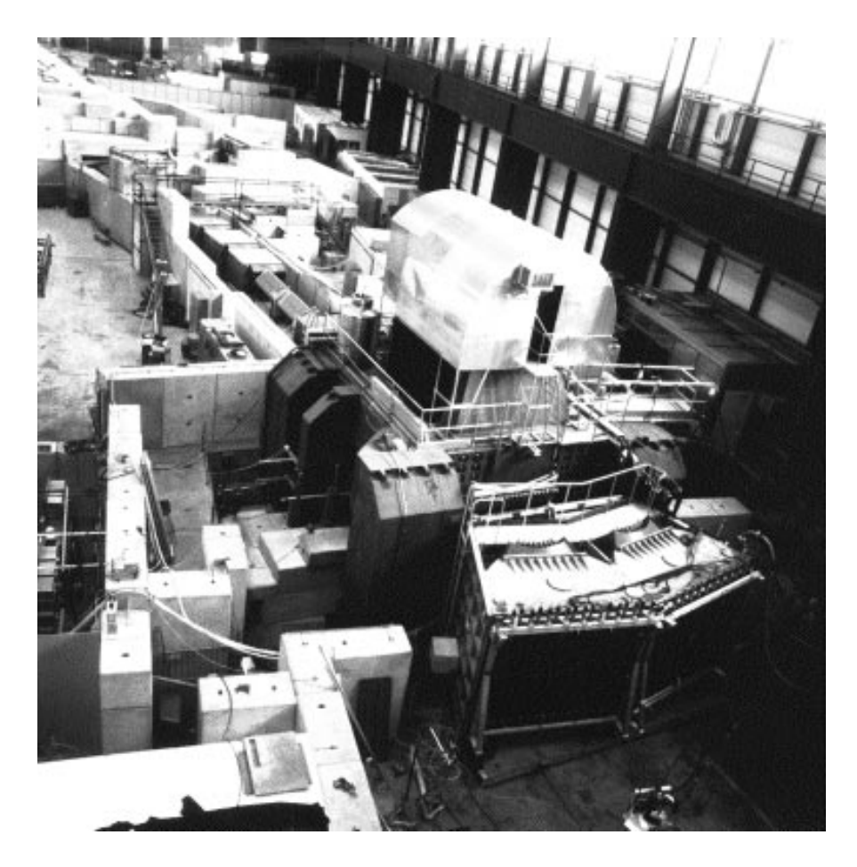
Fig. 1.5: OMEGA as it was in its first phase of exploitation.