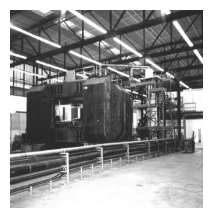
Fig. 1.1: The OMEGA magnet, the masterpiece of Mario Morpurgo.